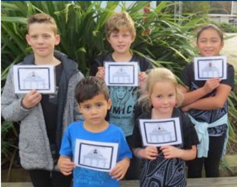
Absent from photo: Reggae Ngatai